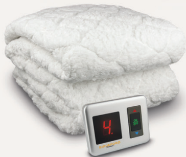
Heated Mattress Pads Cubre colchón