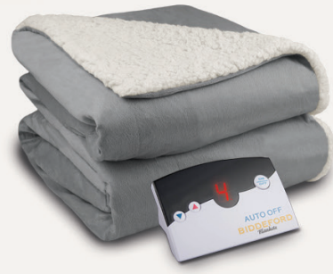
Heated Blankets Manta