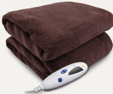
Heated Throws Cobertor