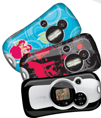
Disney Pix Click