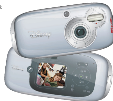
Disney Pix Max