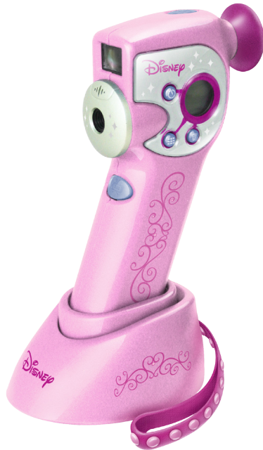
Disney Princess Movie Maker

Note: If the camera is not used for 60 seconds, it will shut itself off to save battery power. To restart the camera, press any button.