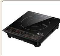
Duxtop Portable 1800W Induction Cooktop