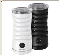
Secura 4-in-1 Electric Milk Frother