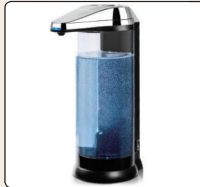
Secura Automatic Soap Dispenser