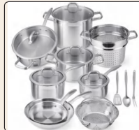
Duxtop Professional Stainless Steel Cookware