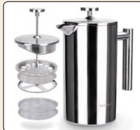
Secura French Press Coffee Maker