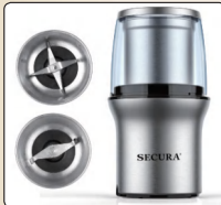
Secura Electric Coffee and Spice Grinder