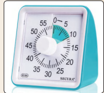
Secura Electronic Visual Timer