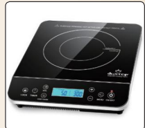
Duxtop 1800W LCD Induction Cooktop