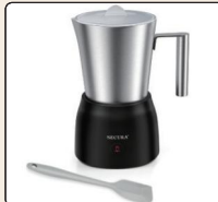
Secura Detachable Milk Frother Upgraded