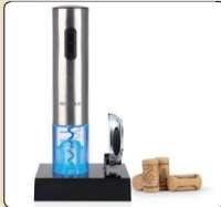
Secura Electric Wine Opener