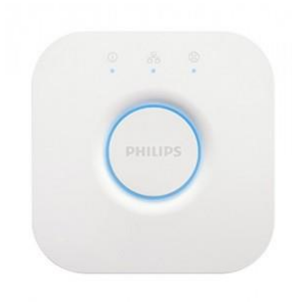
Philips Hue Bridge 1.0