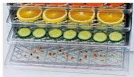
The transparent tray can be used to catch the residue at the bottom of the dehydrator