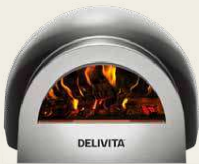
Delivita Origin Very Black

Meet the award-winning Delivita Origin Oven. Designed in Britain and made for sharing, it features traditional clay insulation used in wood fired ovens for centuries, alongside a high-temperature powder-coated steel shell and stainless-steel inner chamber. Reaching over 550°C in just 30 minutes and retaining heat for hours, it lets you cook without limit.