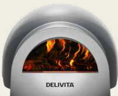
Delivita Origin Hale Grey