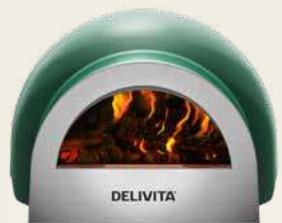
Delivita Origin British Racing Green