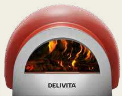
Delivita Origin Chilli Red