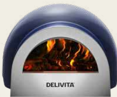
Delivita Origin Royal Blue