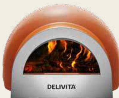
Delivita Origin Blaze Orange